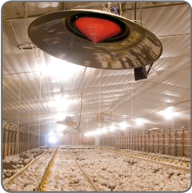
The I-Series Brooders' patented heat efficiency and larger comfort zone help you deliver healthier chicks in less time for less money.

Ground Temperature Comparison The I-40 deliver significantly more radiant heat to the ground than the leading 40,000 Btu/h radiants or 30,000 Btu/h pancake brooders.